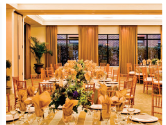
The Pavilion Room