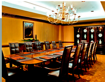
THE RILEY BOARDROOM